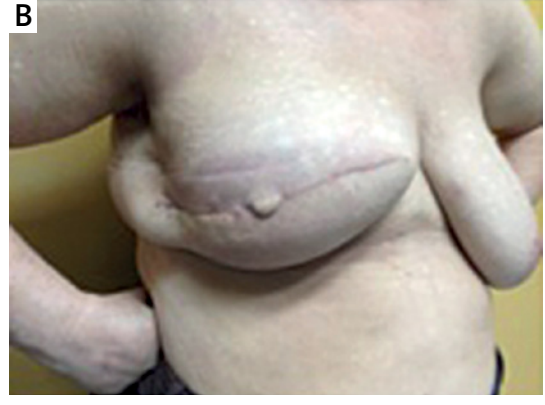
Figure 3. A - 58-year-old patient after neoadjuvant chemotherapy administered due to locally advanced breast cancer. B - Skin-sparing mastectomy with axillary lymph nodes dissection was performed. Simultaneously breast and nipple reconstruction using a rectangular flap was performed. An implant (625 g) was covered with the major pectoralis muscle and a synthetic mesh. After the surgery, the patient was irradiated to the breast and axillary/supraclavicular lymph nodes - the appearance of the breast and the nipple in 12 months follow-up